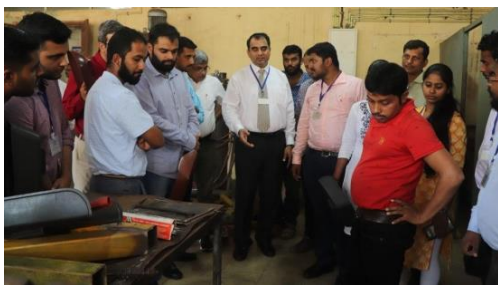
Practical workshop for Welders in progress