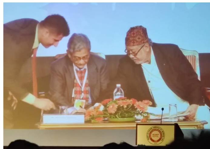
President CEAI signing the MoU with SCAEF

The Nepalese Society of Consulting Architectural and Engineering Firms (SCAEF), organised an International Seminar on 'Resilient Infrastructure for Better Tomorrow' on 18-20 November 2019 at Kathmandu, Nepal.